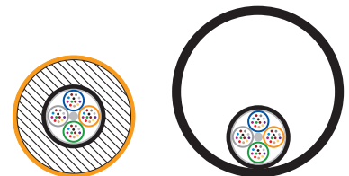
48-count loose tube fiber with Berk-Tek Armor-Tek (.712 in. OD)